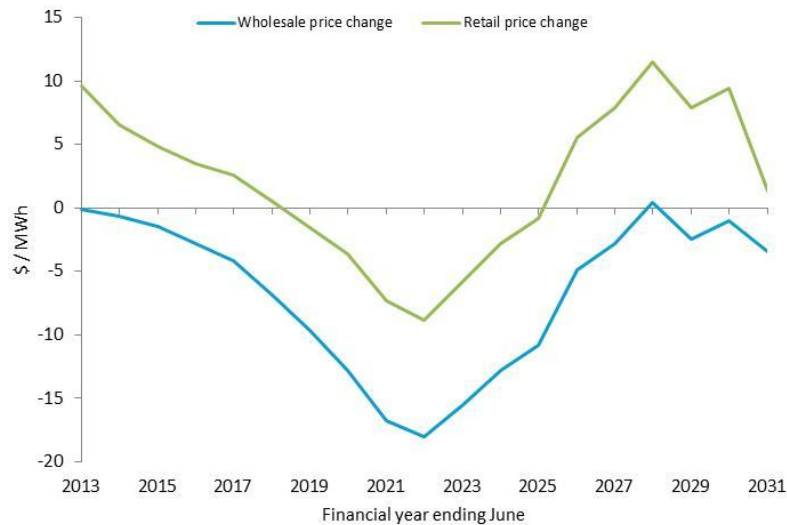
Figure 1. Extract from Climate Change Authority Report on RET Review Change in wholesale and retail prices – no RET compared with reference case 1

Note: A positive number indicates the value is higher in the reference case 1 scenario than in the no RET scenario.